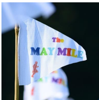
An incredible atmosphere!