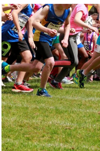
Everyone is part of something special at the May Mile.